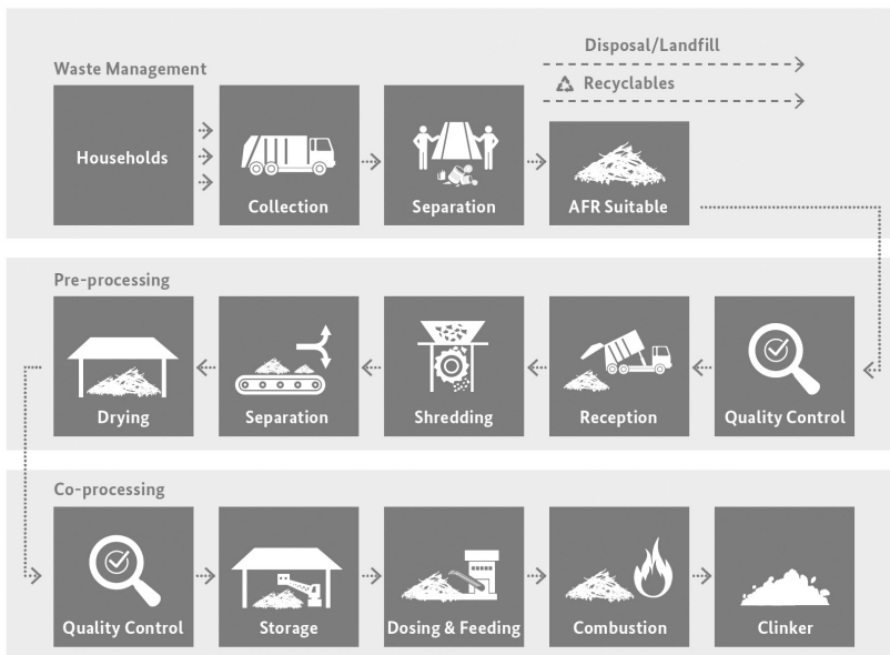
Fig. 18: Pre- and Co-processing within MSW management (cf. Holcim 2020: 29)

tic waste in the co-processing of cement production is clearly superior to conventional incineration – because the high temperatures and long residence time in the rotary kiln destroy pollutants, fully utilize the heat content, and no ash or other residues remain that have to be disposed of in a landfill (cf. GIZ-LafargeHolcim 2020: 1–35; Holcim n. d.; European Union 2020). Although incineration is not the single solution to overall waste management, it provides a reasonable element to manage Lusaka’s current waste (see Fig. 18).