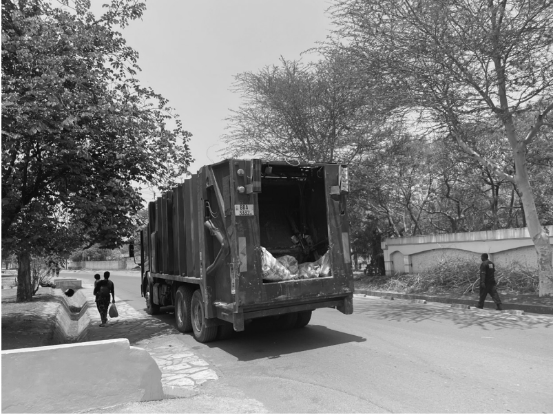
Fig. 13: House-to-House collection Kabulonga, October 2022

In order to offer the waste collection service, the waste collectors must be registered. This registration costs 15.000 ZMW/year and is issued for a period of four years by the relevant official body which is currently not clearly defined. This licensing process also includes a quality control of the waste collector's equipment (cf. Waste Collector 1, personal interview, Lusaka, 17.10.22, see Annexure 3) In addition to waste collection and transport, waste collectors are also responsible for invoicing households, which have to pay a certain collection fee depending on the district (cf. UN Habitat 2010: 34). The waste fee is based on the district's distance from the Chunga Landfill as well as the district's economic strength and has a range of 50 ZMW/month – 250 ZMW/month (cf. Daka, & Madi-musta 2020: 532; LCC, personal interview, LCC, Chunga Landfill, Lusaka, 17.10.22, see Annexure 7) see Tab. 7:).