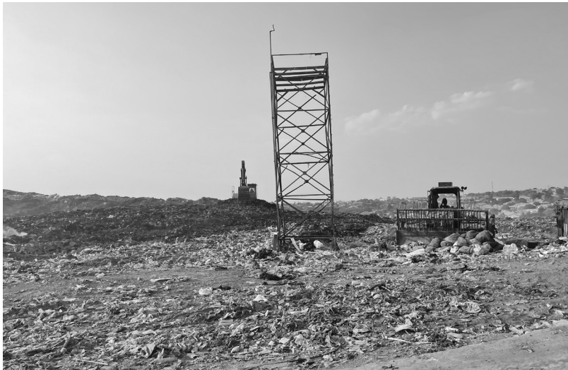
Fig. 15: Equipment Chunga landfill, Lusaka, October 2022

Legal and illegal landfills exist in Lusaka. The majority of franchise contractors transport their unsorted waste to Lusaka's largest landfill: Chunga landfill. The site covers an area of 24,53 hectare and it is controlled by the LCC (cf. Milimo et al. 2021: 571). It was built in 2004 and designed for 25 years but will be in place for the next 50 years (cf. Milimo et al. 2021: 571; LCC, personal interview, LCC, Chunga Landfill, Lusaka, 17.10.22, see Annexure 7). The Chunga site is not currently fenced in entirety due to the need to facilitate access because of weather conditions and the covid pandemic. At the landfill, work is done with simple-looking equipment (see Fig. 15:). There are clear ideas for the optimization of this landfill, such as the rebuilding of the fence, the construction of a new road within the landfill or even the closure of an old area (LCC, personal interview, LCC, Chunga Landfill, Lusaka, 17.10.22, see Annexure 7). Most of the people seen at the dump are waste pickers who make their living by sorting and selling waste (see 4.3.5). There are efforts to register these waste pickers and charge an entry fee of 2 ZMW/day . However, both of these efforts are incomplete in reality due to implementation capacities and suitable tools (e. g., manual paper-based registration of waste pickers).