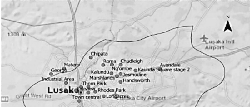
Fig. 16: Waste collection sites (dots) in Lusaka, Zambia (cf. Sambo et al. 2020: 43)

In addition to this large landfill where about 50 % of Lusaka's potential waste, there are also other collection points (see Fig. 16). At the Chunga landfill site, trucks with their loads are weighed at the entrance. The private waste collectors have to pay a fee of 50 ZMW/t the CBE pay less e.g., 200 ZMW for 16–20 t (details see Tab. 9).