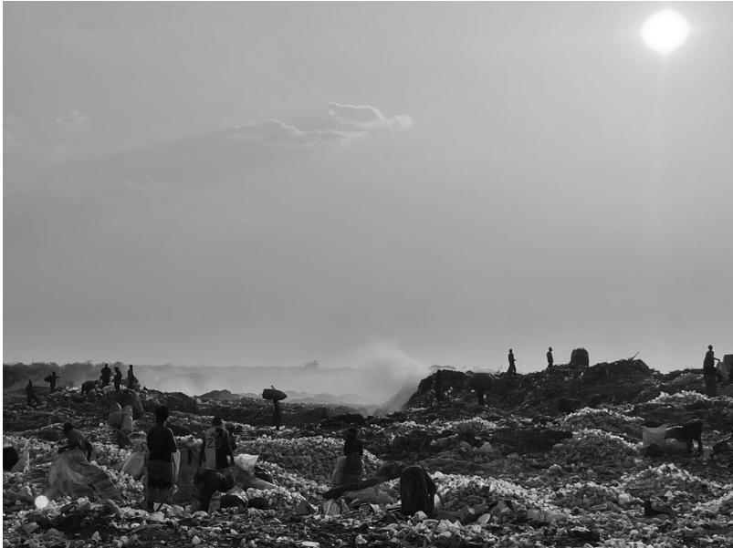
Fig. 11: Chunga landfill, Lusaka, October 2022 (own image)

serve this growth due to various aspects (details as follows). In addition to the quantities, the problem of the composition of the waste has also emerged, as the increasing quantities of plastic are unmanageable as seen on site (see Fig. 11:). These challenges are well known in Lusaka and are already partly addressed in the SWIMP by increasing the recycling rate (SG 8). Furthermore, it might be challenging to take producers into account for optimizing the waste management.