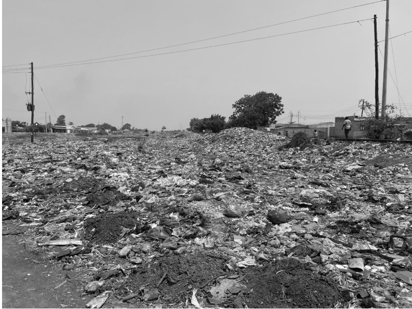
Fig. 17: Misisi, Lusaka, October 2022

at illegal landfills compared to Chunga Landfill (cf. Recycler 2, personal interview, Lusaka, 22.10.22 see Annexure 6). This difference in quality can be attributed to the length of time the waste has been lying around and thus to its contamination. The waste quality though has a high relevance for recyclers and waste pickers (see chapter 4.3.5).