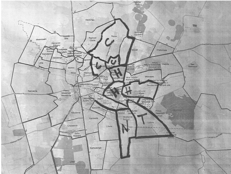
Fig. 12: Lusaka city with exemplary WMD N, T, H, C (adapted image)

Franchise contractor: Based on official documents 16 franchise contractors are currently registered which are taking care of dedicate WMD. The main service of these companies is the collection of waste and its transport to the Chunga landfill. The collection is mostly done by private house-to-house services and takes place on average three times a month (see Fig. 13:). However, waste collection in low-income districts is more unreliable than in districts with higher average incomes (cf. Daka & Madimusta 2020: 532). Depending on the waste collector, different vehicles are available for collection. There are open and closed trucks as well as skip trucks. As observed, this can lead to a high loss of waste during transport. Additionally, collections are not always regularly due to broken or not sufficient equipment or bad roads (cf. Muller et al. 2017: 19).