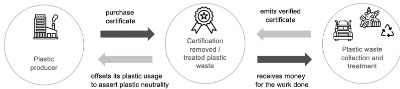
Fig. 8: PC cash and certification flow (own adapted illustration based on TonToTon 2022; icon source iconfinder & flaticon; credits to Freepik; Eucalyp Studio)

ery or even landfilling on a sanitary landfill. Optimally, sufficient money will also be raised to help finance future waste management infrastructure in the country where the PC project takes place (cf. Prevent Waste Alliance 2022c: 5). Using quality standards regarding social and environmental requirements can lead to diverse benefits (e. g., via “(...) creating socio-economic co-benefits by improving income opportunities for waste workers.” (Prevent Waste Alliance 2022c: 2). Following this basis idea PC therefore address the Polluter Pays Principle by shifting the cost towards producers and promotes the internalization of negative externalities like the EPR system do (e. g., waste management costs) (cf. OECD 2016: 21; see also chapter 2.3).