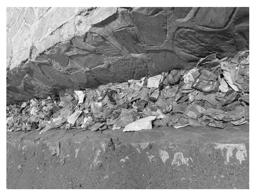
Fig. 1: Blocked sewer, Misisi, Lusaka, October 2022

And even though the impacts are felt locally in the city and need to be resolved, it is also important to involve international and national actors and their requirements (cf. Taylor 2000: 408). Dealing with MSW is also addressed directly and indirectly in the international 17 United Nations (UN) Sustainable Development Goals (SDGs) e.g., in SDG 6: Clean water or sanitation or SDG 12: Responsible consumption and production (cf. UN in Zambia n. d.). To achieve the SDGs, global and local actions must be implemented. An overview of the concrete targets in Lusaka and their impact on the SDGs can be found in the Annexure 9). Also various national initiatives address this complex waste topic either through the objective of a sustainable economy: "Africa by 2063 will have been transformed such that natural resources will be sustainably managed and the integrity and diversity of Africa's ecosystems conserved" (African Union Commission 2015: 34) or directly as a defined goal "We, therefore, undertake to achieve (...) interconnected (...) Circular Economies that are sustainably developed (...)" (Southern African Development Community (SADC) 2020: 5).